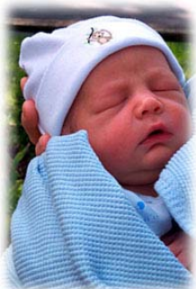
Folic Acid promotes normal fetal development for a healthy baby.

Folate is a form of water soluble vitamin B which occurs naturally in food. Folate gets its name from the Latin word "folium" which means leaf. Folic acid is a synthetic form of this vitamin found in fortified foods and supplements. Both are needed for DNA synthesis to build and maintain healthy cells. Folate helps to prevent changes to DNA