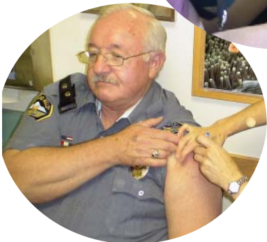
Public Health...Everyday, Everywhere, Everyone