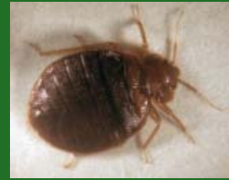
Enlarged view of bed bug

Have you seen THIS bug on or near your mattress or other sleeping area?