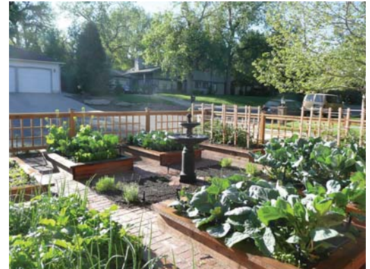
Front yard vegetable garden in Applewood

Last month, the AFFV hosted Quint Redmond, founder and principal of Agriburbia. He provided a presentation on sustainable agriculture in Wheat Ridge. Our next Task Force meeting will be held on Tuesday, August 25th from 5:30-7pm at the Highlands South Senior High Rise at 6360 W 38th Avenue.