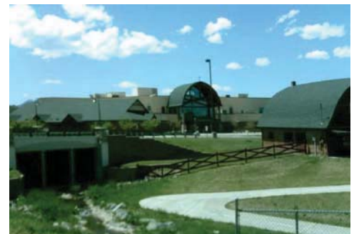
Wheat Ridge Recreation Center: A great city amenity that is a good example of a community wide active community environments project.