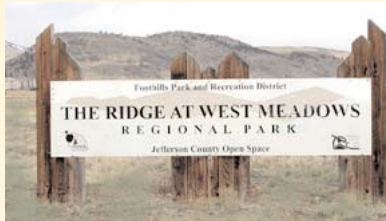
Projects are signed to acknowledge Open Space Fund participation.