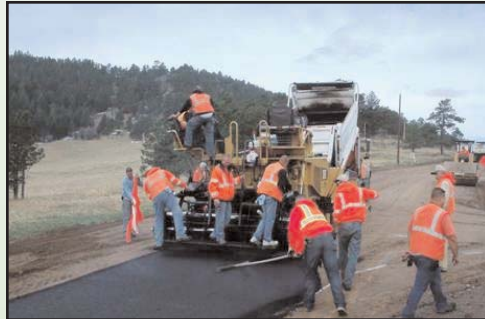
White Ranch Park Entry Road improvements