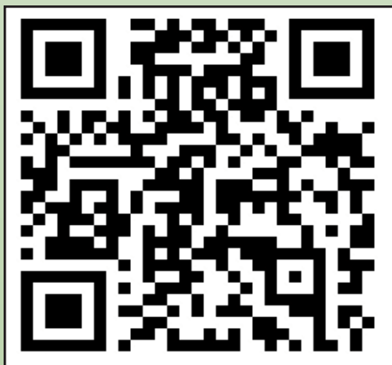
North Table Mountain Park QR Code

Five miles of the planned 9-mile Reynolds Park to the South Platte River Trail have been completed.