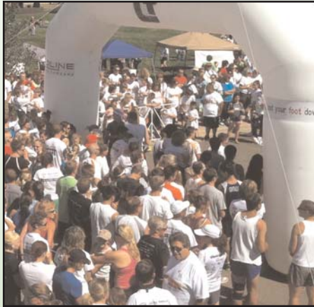
Second Wind Fund 5K and Music Festival