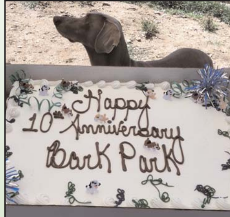
Elk Meadow Park Dog Off-Leash Area Celebration

Visitors to the Elk Meadow Park Dog Off-Leash Area celebrated the 10th Anniversary of the "Bark Park," the 6-acre fenced portion of the park located on the south side of Stagecoach Boulevard in Evergreen. Dogs were treated to biscuits, water and complimentary "Wag-n-load" pouches - specially designed bag for pet waste to help maintain a clean and healthy environment. Seventy-five human and at least as many dogs were in attendance.