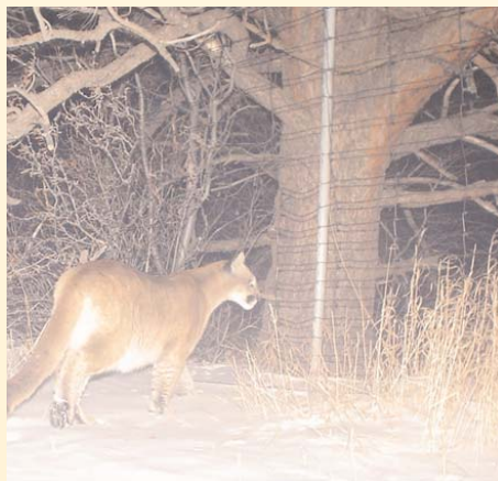
Activity captured with motion-activated cameras near the perimeter fence at Lookout Mountain Nature Preserve.