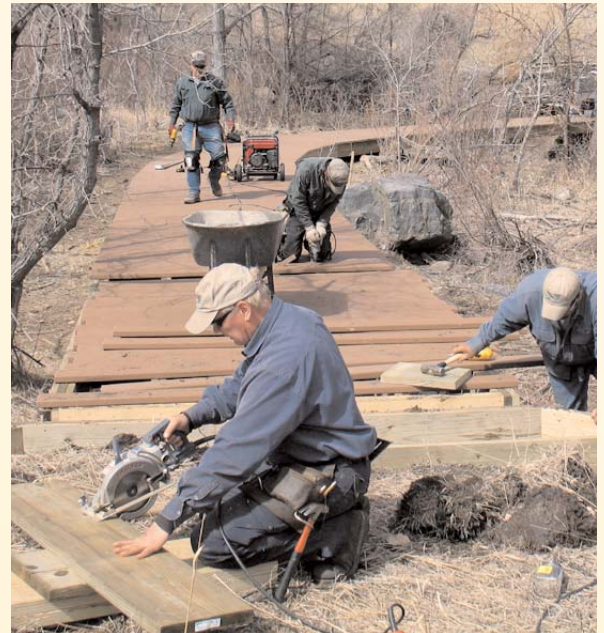
Construction of boardwalk at Matthews/Winters Park.