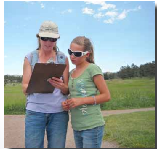
Park visitors helping answer survey questions.