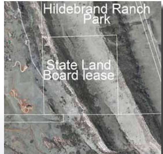
Renewed 160-acre lease south of Hildebrand Ranch Park.