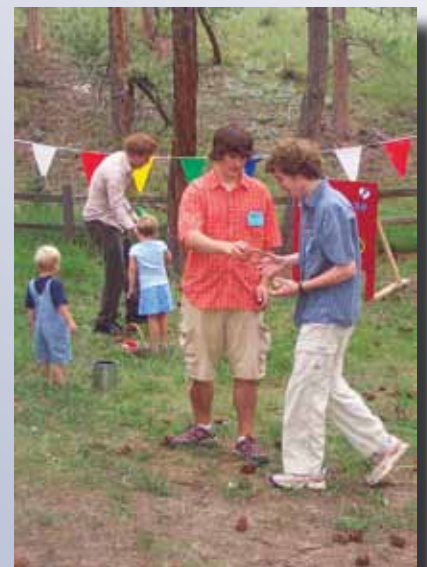
The Grove, next to Hiwan Homestead Museum, was recently donated to Open Space.