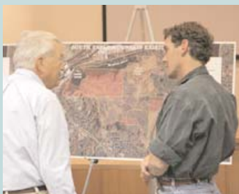
South Table Mountain Open House.