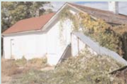
Hildebrand Ranch Park structures under historic assessment.