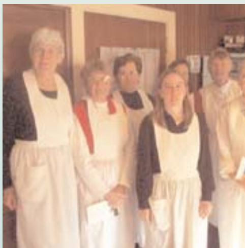
"Harvey Girls" appear at Hiwan's Adventure Trails on Colorado Rails event.

The Second Annual Outdoor Quilt Festival held in September featured nearly 100 colorful handmade quilts loaned by local quilt makers and quilting organizations. The Hiwan Halloween Celebration on October 30 drew ghosts, ghouls, witches, fairy princesses, dinosaurs and a host of other creepy crawly guests to the Museum to enjoy scary music, children's crafts, prizes for everyone in costume and the old-time radio show Inner Sanctum . The Southwestern Splendors Indian jewelry, on loan from the Humphrey Memorial Park and Museum, proved to be very popular with visitors.