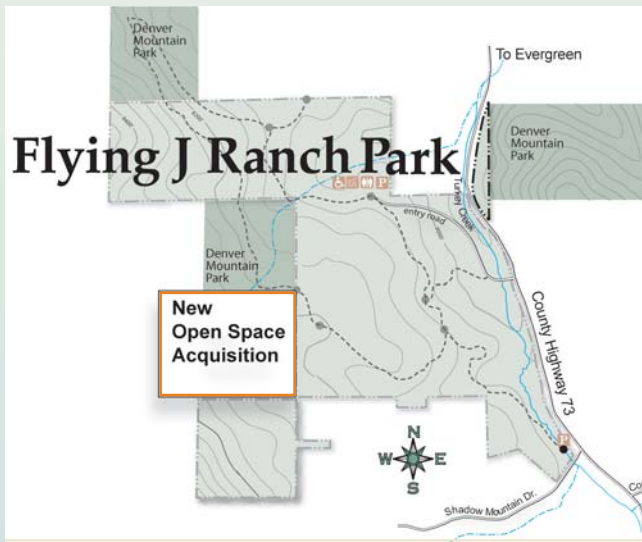
Park addition required formidable team work.