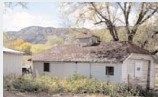
Hildebrand Ranch Park