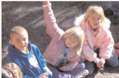
In the backyard... Lookout Mountain Nature Center