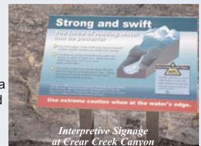
Interpretive Signage at Clear Creek Canyon