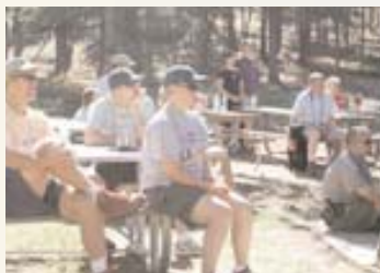
Flying J Ranch Park Dedication October 1, 2005