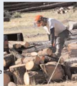
Fuel Wood Sale Elk Meadow Park