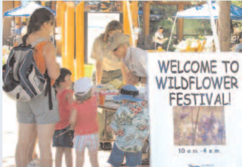
Young visitors enjoying their day at the Lookout Mountain Nature Center and Preserve.