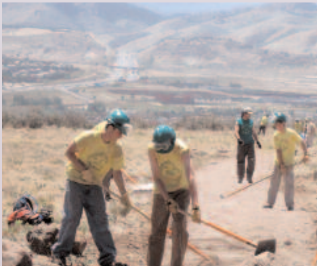
Youth Work Program participants moved tons of crusher fine material and drank lots of water!