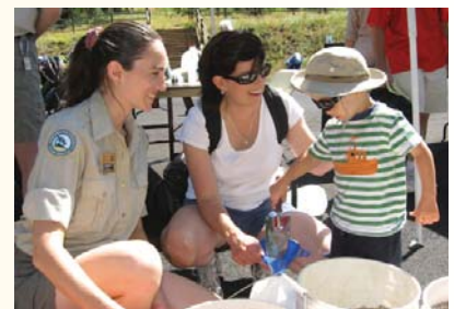
River Festival 2009 at Pine Valley Park.