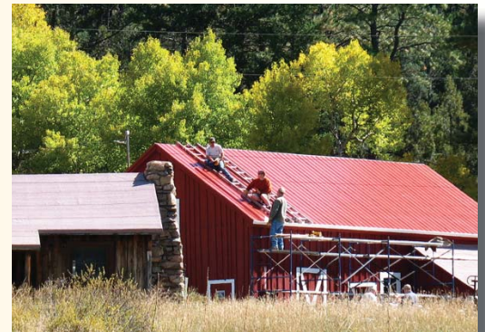
Open Space staff work on the Reynolds Park residence buildings.