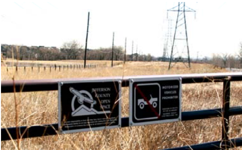
A future section of the Van Bibber Creek Trail, looking east from Easley Road

Extending the Van Bibber Creek Trail has been a long-standing objective of the Open Space program. The vision behind this goal is of Van Bibber Park visitors beginning and continuing longer trips here within an interconnected, regional trail system.