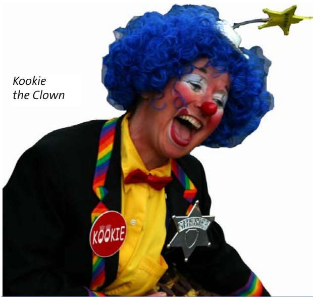
Kookie the Clown

dares, and responsible reporting. Our goal is to give children the knowledge and confidence to make smart choices every day, and trust their instincts to stay out of danger.