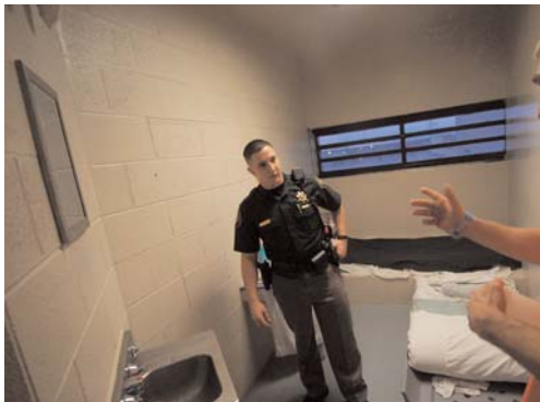
A deputy talks with an inmate during inspection

The Jefferson County Detention Facility opened in 1986 at its current location at 200 Jefferson County Parkway