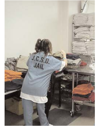
An inmate folds laundry

The Sheriff's Office provides a variety of programs for the inmate population. Many of these programs are financed by proceeds from inmates' purchases of snacks, stamps and other commissary items.