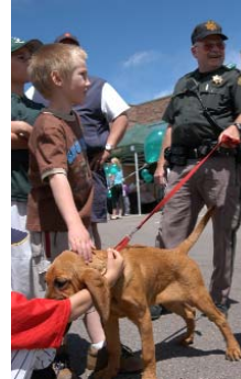
K-9 Unit deputy and bloodhound pup

The Jefferson County Sheriff's Office mountain precinct, located at 4990 Hwy. 73 in Evergreen, makes Sheriff's Office services more accessible to Jefferson County's mountain area residents. The building is located next to the public library at the intersection of Highway 73 and Buffalo Park Road, south of downtown Evergreen. Business hours for the public are 8 a.m. to 5 p.m., Monday through Friday, but