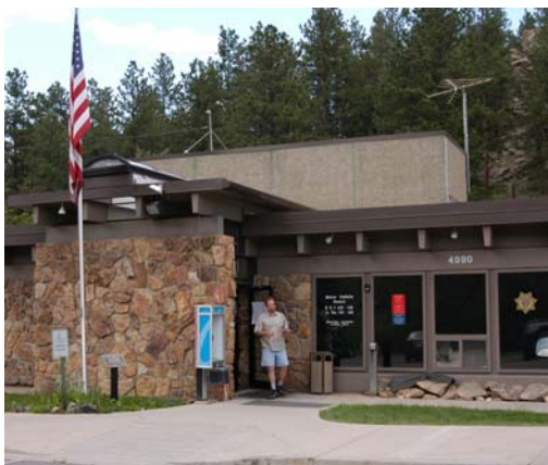
Mountain Precinct building